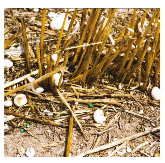
TREATED PLOT - <u>Dead</u> Italian Snails 9 days after application