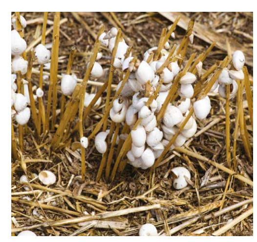
UNTREATED PLOT - Italian Snail :

"If a farmer is comparing different baits, I tell them, 'if you want to bait 3 times put the cheaper stuff out. If you want to bait once use the Metarex Inov."